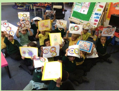
Nursery – Whole Class showing off their beautiful art work influenced by the Painter/Artist, Wassily Kandinsky.