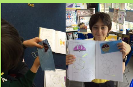
Noah & Mohamed – Year 6 Noah used coordinates to create a fantastic cross stitch design and Mohamed used a compass to create a beautiful pattern.