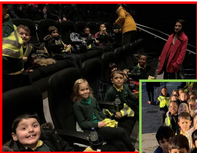
Year 1 had a great trip to the cinema to watch Clifford the Big Red Dog.