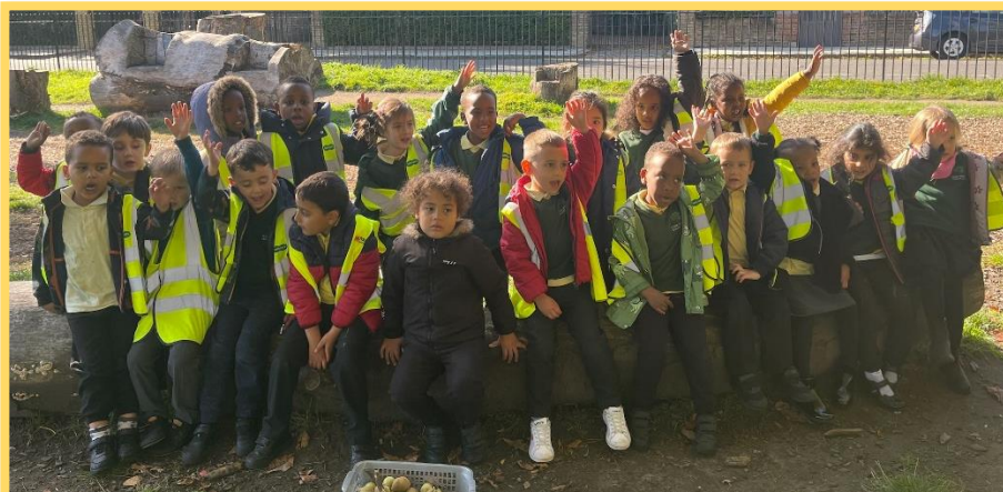
Reception class collected leaves, conkers and pine cones during their walk in Ravenscourt Park for their autumn activity.