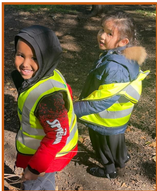
Nursery class developed both their fine motor skills and their maths skills this week, as they made patterns on peg boards by placing them in sequence.