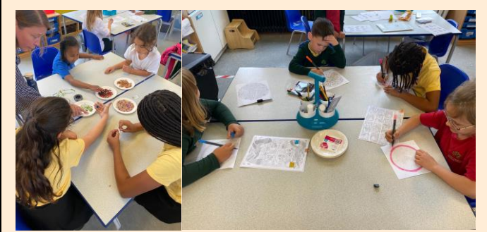
Our new Irish Culture after school club is being thoroughly enjoyed by all.